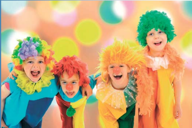
Whoever went through hell shall be able to be a kid again.

Instead of spending one euro today, we currently prefer to spend two and a half to three euros in the future, half of which is financed by the entrepreneurs and half by the policyholders through social security contributions. This fact should be on its own an incentive for each of us to actively support the Bowspirit Kids.