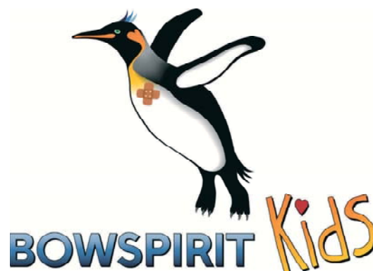
(Illustration: Bowspirit Kids Group)

This translated reprint from the German-language maritime online magazine schiffsjournal.de is courtesy of the author Kai Ortel and the publisher Tobias Bruns. Thank you very much!